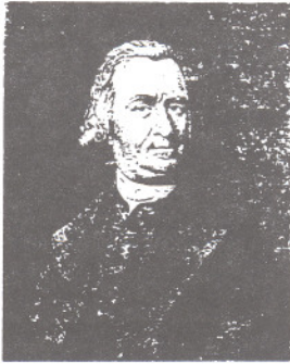
Samuel Adams 1722-1803