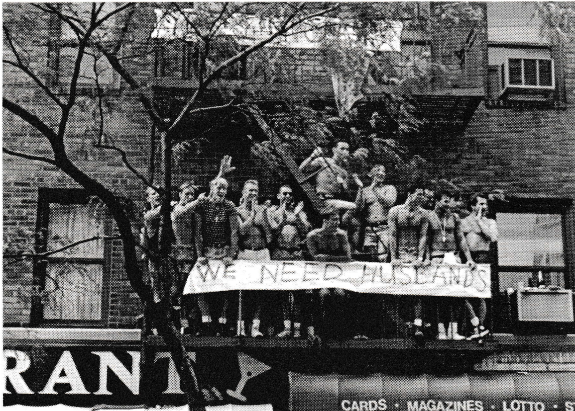
Some of the gorgeous scenery along the march to Central Park, NYC, June 26, 1994